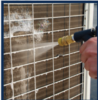
Fine or wide spray

to wash even the dirtiest coils, without damaging sensitive fins. And the small portable size lets you clean coils from the front or back of the coil – a proven method for increasing coil cleaning and system efficiency. CoilJet makes cleaning coils quick and easy. Now that's smart.