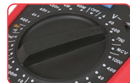
High quality dial