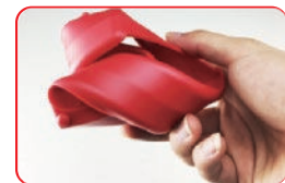
Super soft Insulator, meter is able to withstand 2m drop